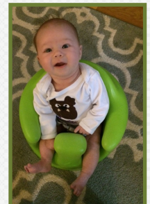
Sitting Up in the Bumbo Seat