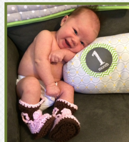
One Month Old 9/12/14